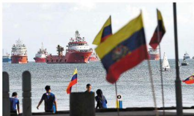
The Labuan Port is one of the landmarks in Labuan.