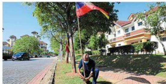
Federal Territory flags being put up along the sidewalk in Putrajaya as part of the 'Raise the Flag' campaign in conjunction with FT Day celebrations.

"We are also organising the MyGrocer@Wilayah programme, a marketplace which offers food items such as chicken, fish, vegetables, eggs, flour, sugar, rice and cooking oil at a subsidised rate, twice a week at 39 loca-