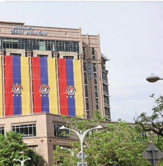
Four giant Federal Territory flags cover the facade of Menara Seri Wilayah, where the Federal Territories Department is located.

(Right) The MyGrocer@Wilayah programme will be held twice a month at 39 locations in Kuala Lumpur, Putrajaya and Labuan, offering 5% to 20% discounts on food compared to the market rate.