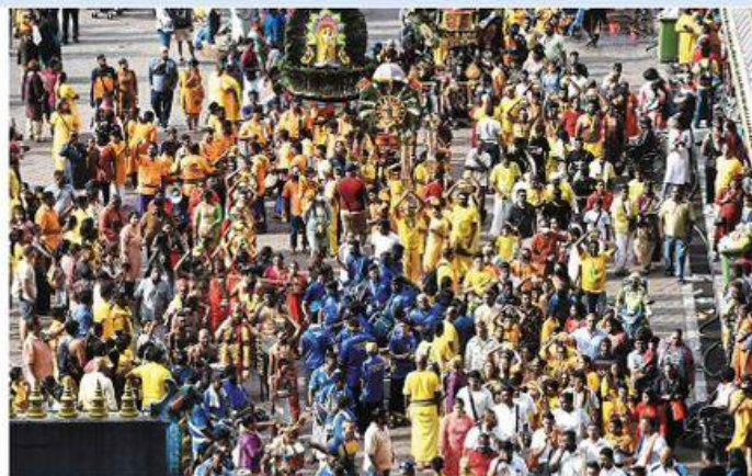
A big crowd at Batu Caves last weekend, ahead of Thaipusam on Feb 5.

Thaipusam will be celebrated by Hindus in Malaysia on Feb 5.