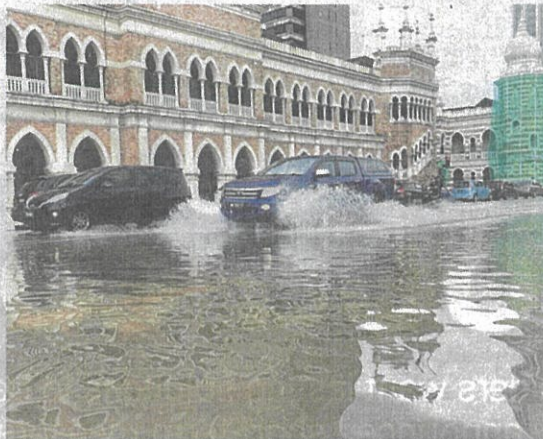
Cars going through floodwaters in Dataran Merdeka after a downpour in the city centre on April 25.

Review entire city infrastructure and eco-system in light of new climate norm, urge stakeholders