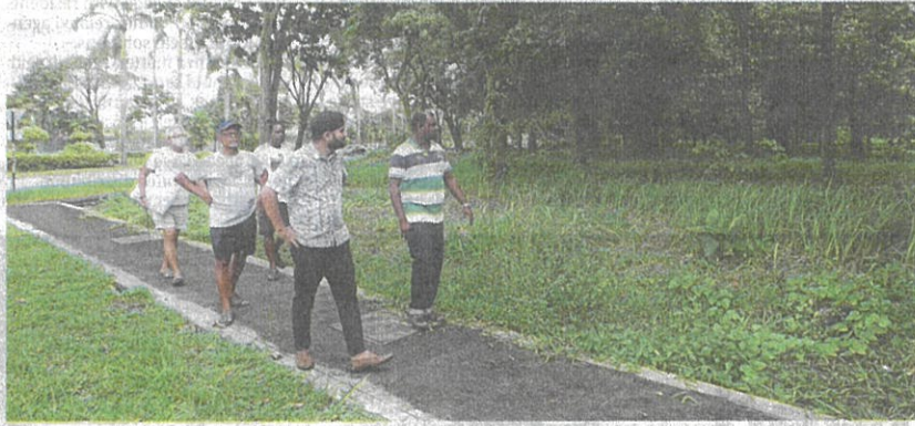
Bandar Parklands residents looking at the site for a proposed high-rise project in Klang.