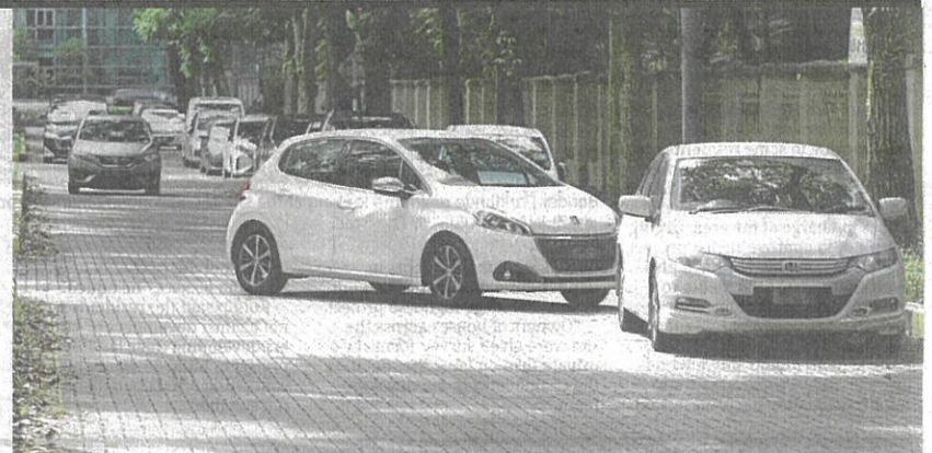
Motorists who park their vehicles along Jalan Kiara 1 are obstructing traffic along this main access to several condominiums in Mont Kiara.

StarMetro in an April 13 report highlighted that DBKL had issued 2,386 compounds to errant motorists for parking along Jalan Kiara 1