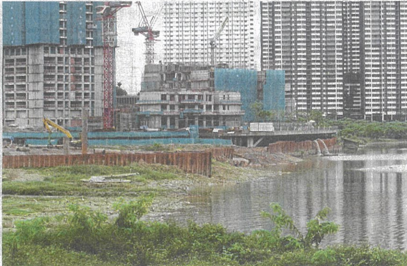
Some are concerned that projects allowed to take place near rivers or ponds could result in sediment flowing into the water, thus reducing capacity to hold rainwater.

"MPK will also take the people's feedback into account," she added.