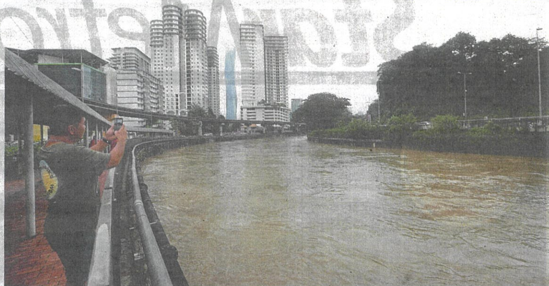
High water level at Sungai Klang as a result of heavy rain earlier in the day. Activists say urban development has changed the natural topography of Kuala Lumpur, thus reducing the city's ability to absorb rainwater.

University of Nottingham and Maya Press are organising and sponsoring a short story competition. Stories must be written in English, be on any theme or subject, between 2,000 and 3,000 words and must be unpublished and original. Each author can submit a maximum of two essays. Open to Malaysians over 18 years of age. Deadline is June 1. For details, visit shorturl.at/rBFTY