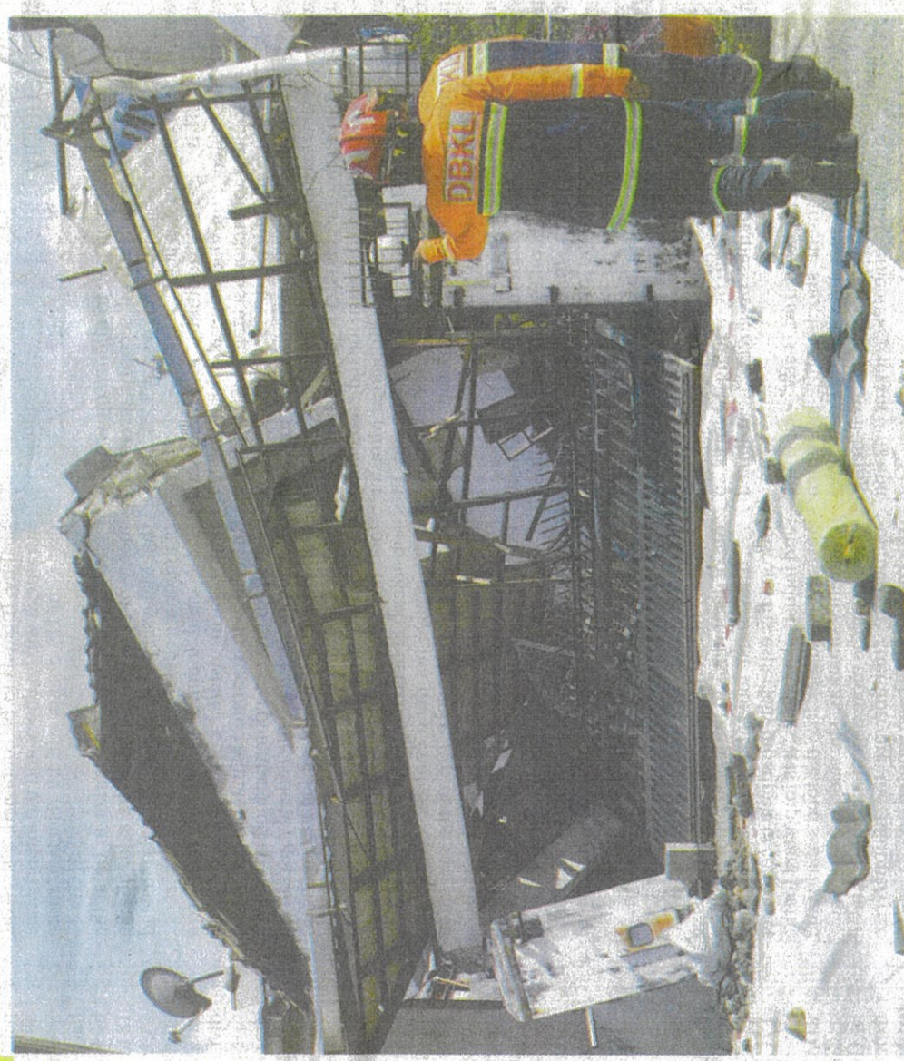
City Hall has issued a stop-work order to the developer after a double-storey terrace house collapsed while undergoing renovation. — BERNAMAPIX

In the incident, the terrace house that was still under renovation collapsed. Occupants of six houses were ordered by the Fire and Rescue Department to evacuate. — Bernama