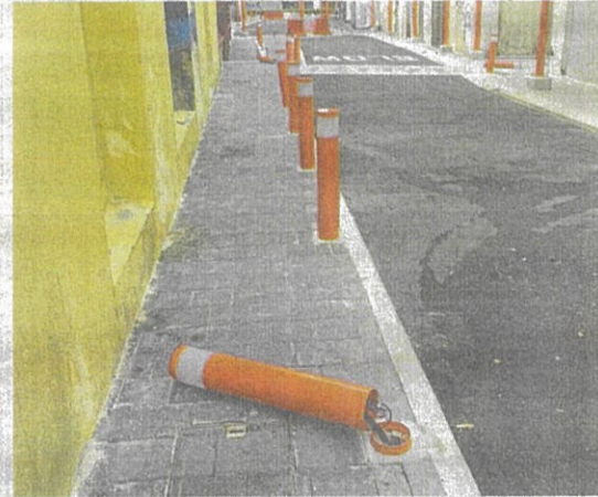
Vandalised security bollards at Lorong Bandar 11.

"We do not know who did it, but that clock is sentimental to us."