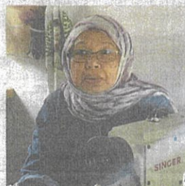
RB Hashim says Bazar Melawati is no longer drawing the crowds.

the food court's ageing infrastructure and poor stall occupancy were factors keeping people away.