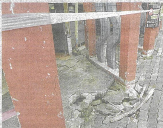
The broken pavement outside Medan Selera Lama Taman Melawati is a safety hazard. This food court is in dire need of an upgrade as well.