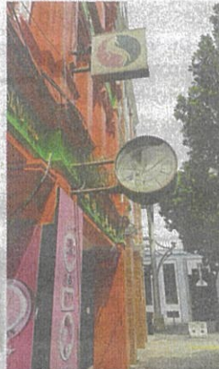
This clock outside a shop near Central Market was damaged by irresponsible people.

A Think City employee, who declined to be named, said he found out from the homeless that it was the work of drug addicts under the influence.