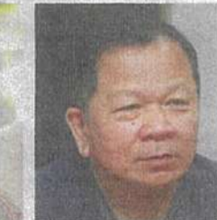
Tan calls on supermarkets to take responsibility for lost trolleys.