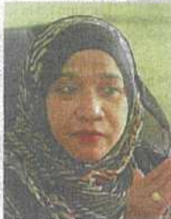
Ummi suggests installing a tracker on trolleys to curb dumping.