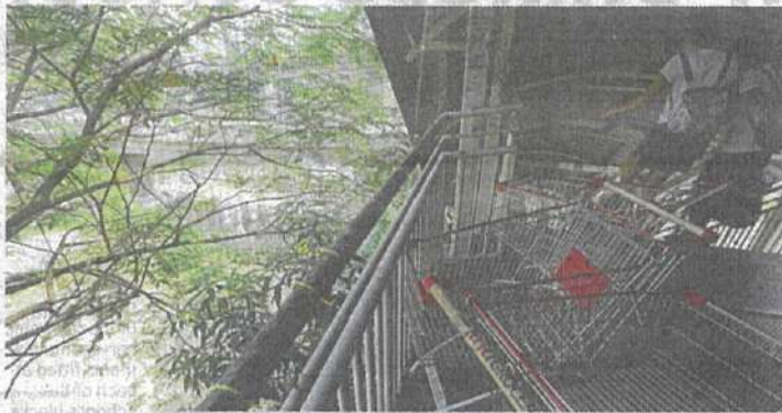
Trolleys abandoned by shoppers at a pedestrian bridge in the Mid Valley area in Kuala Lumpur.

As a result, more trolleys were abandoned, posing a nuisance to Kuala Lumpur City Hall and Alam Flora.