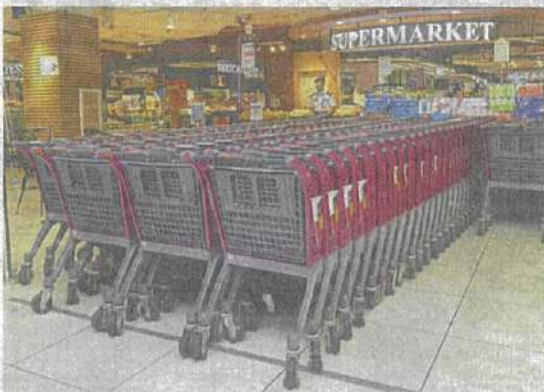
Supermarket trolleys cost about RM300 to RM400 each.

adopted by Aeon to manage this situation is through a cooperation formed with security and facilities management personnel, with the support of building owners and joint management body.