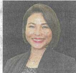
Sunny: The coin-lock system has helped to reduce the number of trolleys leaving Aeon's premises.