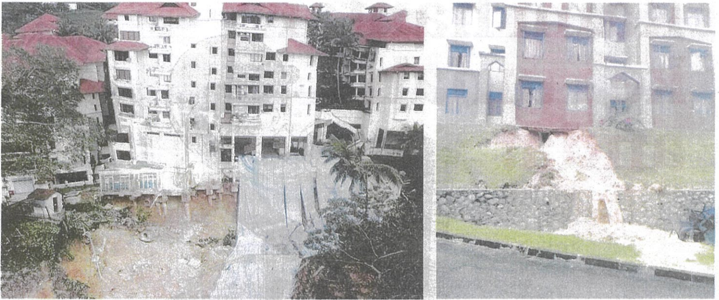
PENDUDUK di Apartmen Sri Duta 1, Kuala Lumpur (kiri) diarahkan berpindah selepas kediaman mereka diancam tanah runtuh akibat hujan lebat sejak minggu lalu, manakala gambar kanan menunjukkan keadaan asrama Mahallah Zubair Al-Awwam UIAM di Gombak yang turut dilanda situasi sama kelmarin.

Kejadian tanah runtuh, mendapakan jalanancam keselamatan lebih 200 penghuni