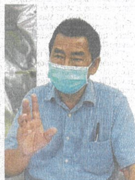
Yee urges the government to stop approving retention pond sites for development.

This came after claims by Segambut MP Hannah Yeoh that six retention ponds were alienated between October 2015 and September 2020 for development.