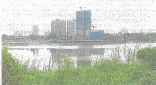
This retention-pond in Taman Wahyu, Kepong, is earmarked for development but there are fears it can affect flood mitigation efforts in Kuala Lumpur.

He cited the retention pond in Taman Wahyu, Kepong, that had been earmarked for a mixed development project.